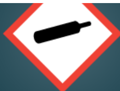
Gas under pressure